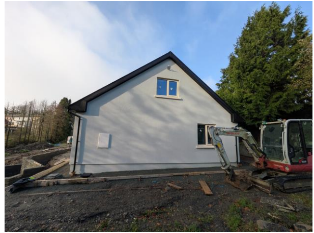
Photograph 2 – Side elevation of dwelling