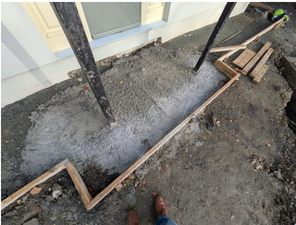
Photograph 5 – View of canopy support