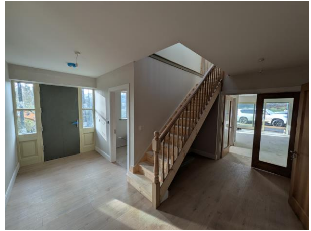
Photograph 8 – View of internal finishes