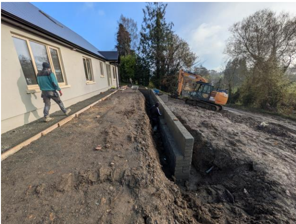
Photograph 11 – View of masonry retaining wall