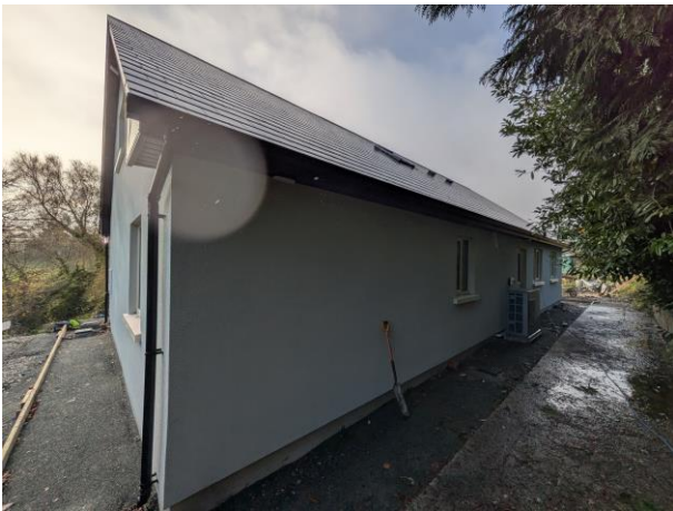
Photograph 3 – Rear elevation of dwelling