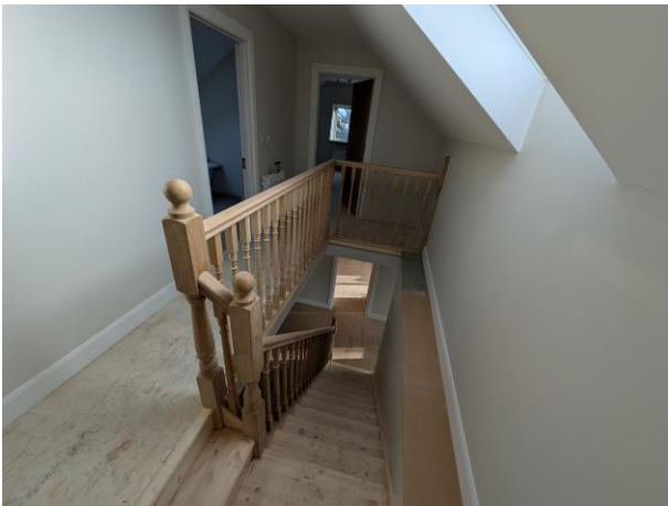
Photograph 9 – View of internal finishes