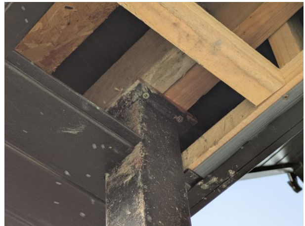
Photograph 6 – View of canopy support