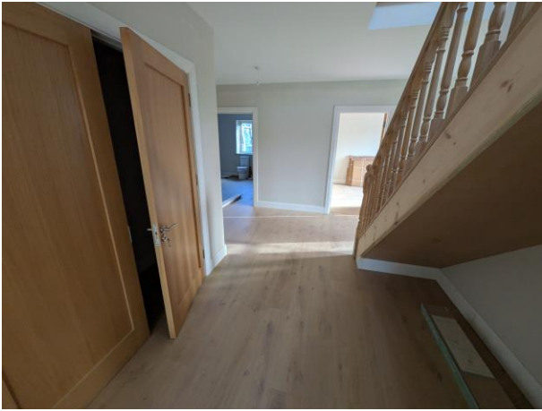
Photograph 7 – View of internal finishes