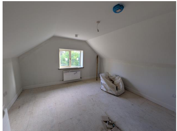
Photograph 10 – View of internal finishes