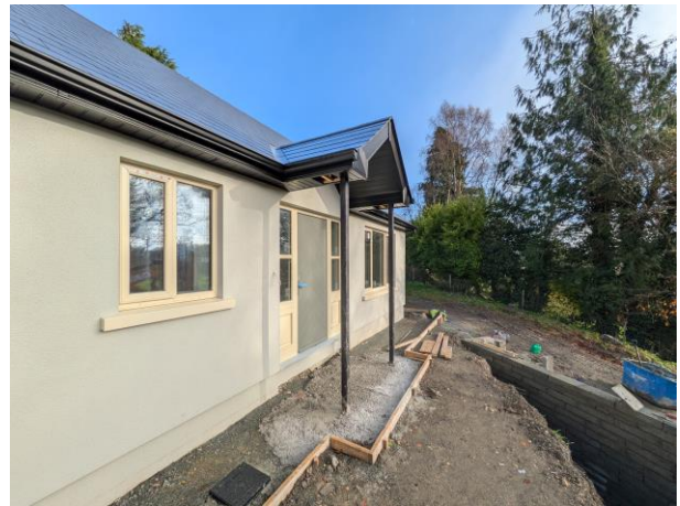
Photograph 4 – View of porch columns / supports