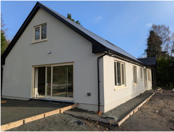
Photograph 1 – Front / Side Elevation of dwelling